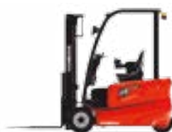
A Series 1.3 - 2.0t, 3 Wheel Electric