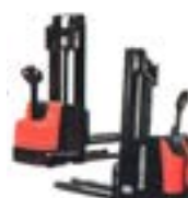
Stacker Range 1.2 - 2.0t Pallet Stacker