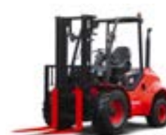
Rough Terrain 2.5 - 3.0t, Diesel