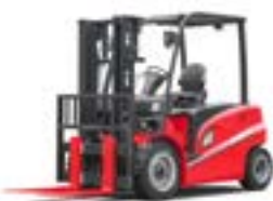
A Series 4.0 - 5.0t, 4 Wheel Electric