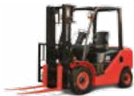
XF Series 1.0 - 3.5t, Diesel/ LPG