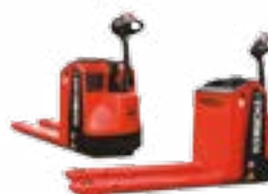
Premium Range 2.0t Powered Pallet Truck