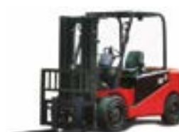
J Series 5.0 - 8.5t, 4 Wheel Electric