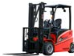
A Series High Performance 2.5 - 3.5t, 4 Wheel Electric