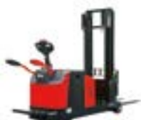
A Series 0.8 - 2.0t Counterbalance Stacker