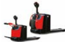
Hi Range 2.0 - 3.0t Powered Pallet Truck