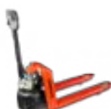
Hand Pallet 1.5 - 1.8t Semi-Electric Hand Pallet Truck