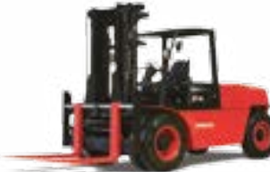
XF Series 8.0 - 12.0t, Diesel