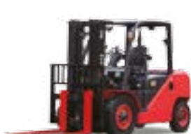
XF Series 4.0 - 5.0t, Diesel/ LPG