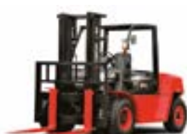
XF Series 5.0 - 7.0t, Diesel/ LPG