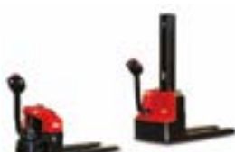
Mini Range 1.5t Powered Pallet Truck 1.0 - 1.2t Pallet Stacker